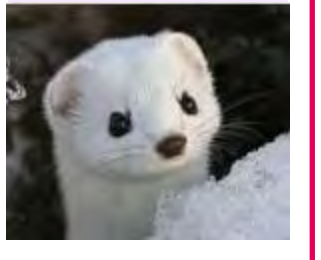
Stoat オコジョ Okojo